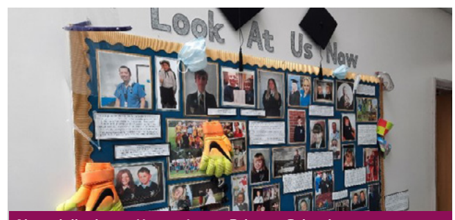
Alumni display at Hetton Lyons Primary Schoo

However, despite the challenges it created, some respondents noted that the pandemic had led to a number of pilot schools rethinking the skills their pupils would need to be resilient and successful, and the importance of careers-related learning to support the development of these skills.